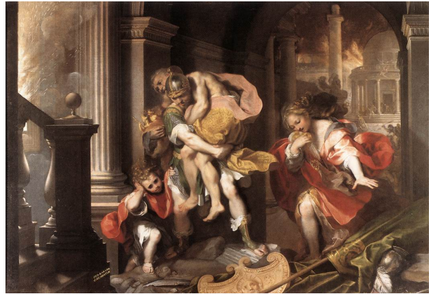
Aeneas flees burning Troy (1598). Galleria Borghese, Rome

Responsibility: I will act with civility and serve others wherever possible.